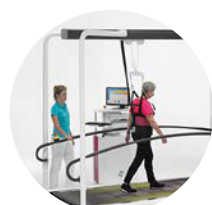
Motek C-Mill a DIH brand